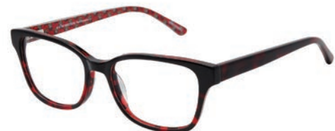
Harry Potter HPE203R